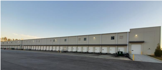
Photo caption: The new 6,200 m 2 Gebrüder Weiss Warehouse has 22 dock doors.