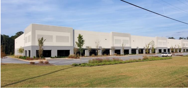
Photo caption: Gebrüder Weiss USA opens a new warehouse near Atlanta to better serve the Southeast market.